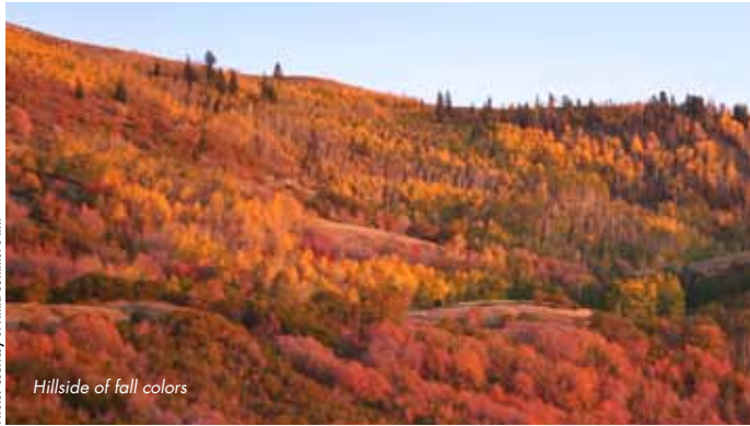
Hillside of fall colors