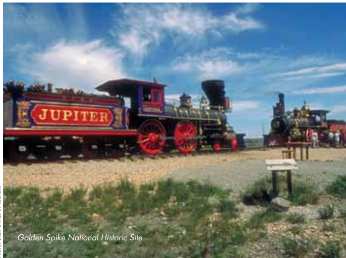
Golden Spike National Historic Site