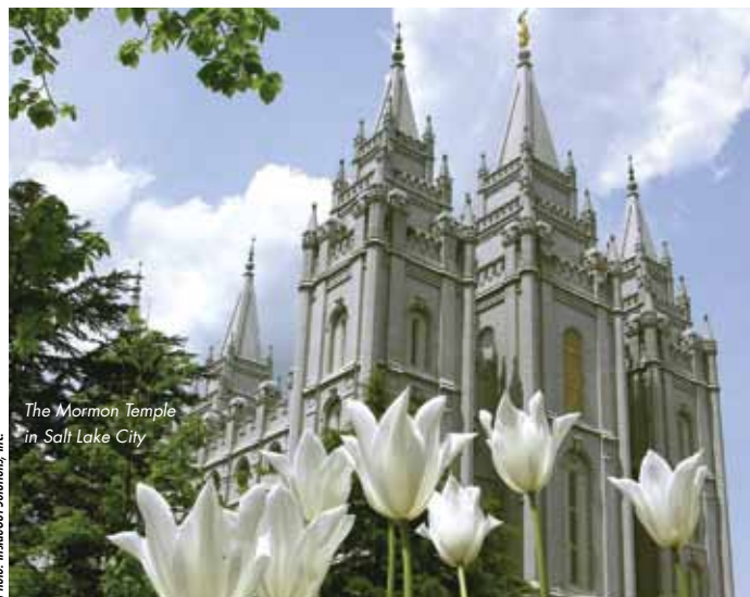
The Mormon Temple in Salt Lake City