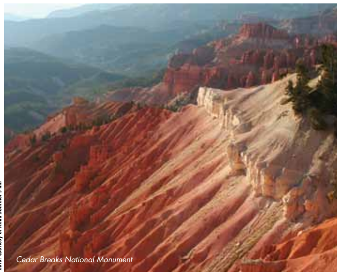
Cedar Breaks National Monument