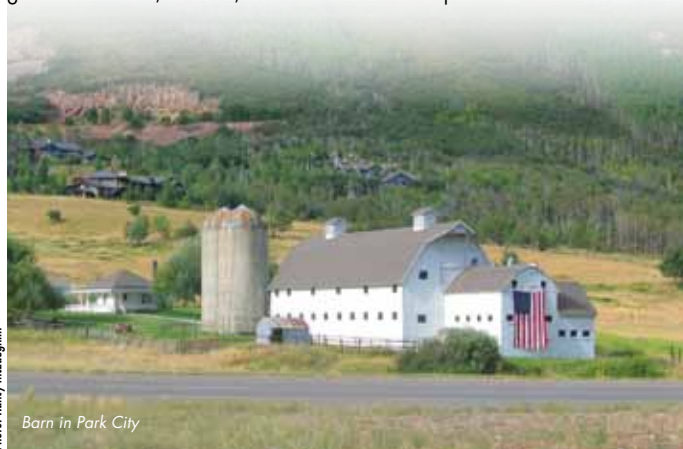
Barn in Park City