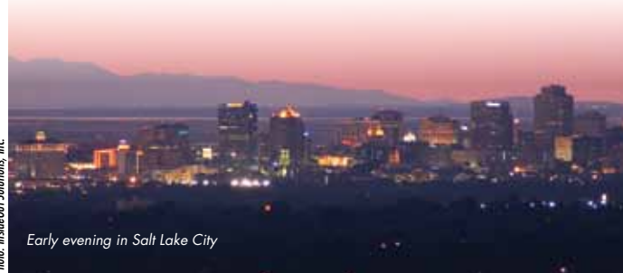
Early evening in Salt Lake City