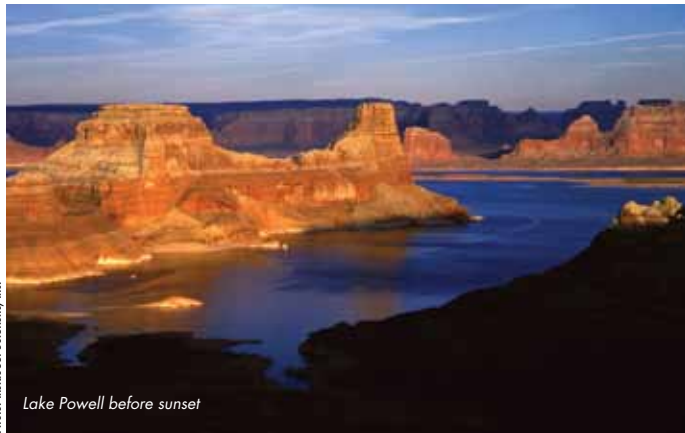
Lake Powell before sunset