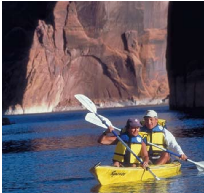
Kayaking in the canyons

Cedar Breaks National Monument: The monument is located east of Cedar City in Southwestern Utah. Touring the monument is a great way to see how erosion can shape and change a plateau. The monument has been called a mini Bryce Canyon. An immense amphitheater carved over decades contains rock formations colored by iron and manganese. The 6,155-acre area contains hiking trails, scenic drives, campsites and picnic areas.