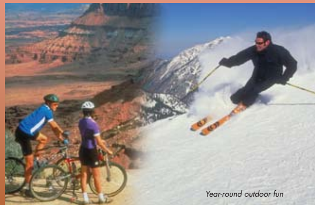
Year-round outdoor fun

Not only does Utah have "The Greatest Snow on Earth", but we're also famous for our spectacular mountain biking, including Moab's Slickrock Trail. There are also scenic hikes, premier golf courses, blue ribbon fishing streams, challenging rock climbs and miles of off-road, cross country skiing and snowmobile trails. For the less adventure-some, peaceful forests and serene wildflower meadows welcome those who want to lose themselves in nature.