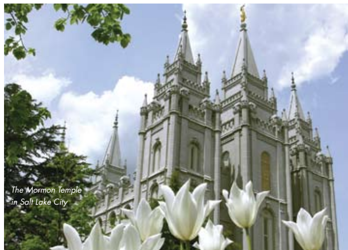
The Mormon Temple in Salt Lake City

Logan: Travel along US Hwy. 89 through almost vertical canyon walls from the town of Logan to Bear Lake. The canyon slices through the peaks of the Wasatch Mountains following the Logan River. Activities include rock climbing, fishing, bird watching, camping, hiking, boating and more at Bear Lake.