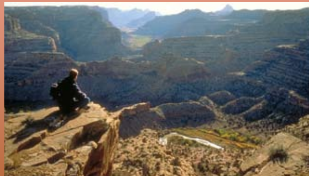
Taking in the view

Zion, Bryce Canyon, Capitol Reef, Canyonlands and Arches national parks call Southern Utah home. In addition, the North Rim of the Grand Canyon, Grand Staircase-Escalante, Glen Canyon Recreational Area, Natural Bridges National Monument and access to Monument Valley share the region. Each park features some of the most breathtaking landscapes in the Southwest.