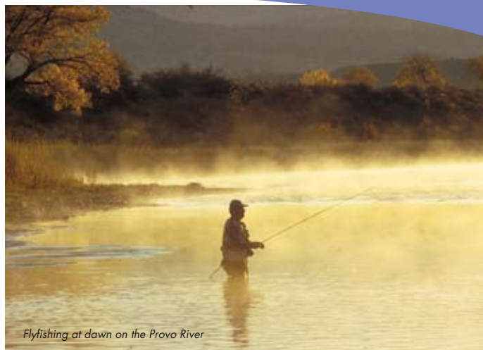
Flyfishing at dawn on the Provo River

Park City: This classic alpine town features some of the state's best ski resorts and is a favorite spot for hiking, backpacking, camping and fishing in the summer. East of Salt Lake City off I-80, the city hosted numerous 2002 Winter Olympic competitions. Park City is also known as the home of Robert Redford's annual Sundance Film Festival. Each January, the festival showcases new work from American and international independent