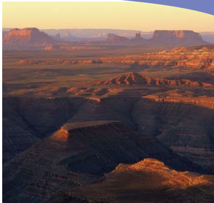
Sunset in the San Juan River Canyon

St. George: Known as “Utah’s Dixie”, St. George is a popular retirement destination and a popular second home community. Residents and visitors are attracted to St. George’s scenic beauty and its close proximity to Zion National Park, Lake Powell and Grand Canyon National Park. Area recreation includes more than 10 golf courses, numerous hiking and biking trails, as well as the many cultural events that occur in the area. Both Tuacahn and the St. George Musical Theater bring Broadway to the desert, along with other venues that provide a wide